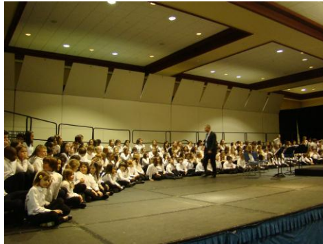
It's time to consider your 4 th and 5 th graders for All State Chorus!